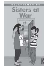
Single copy: 978-1-905579-66-2 Value Pack (6 copies): 978-1-905579-72-3