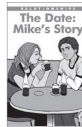
Single copy: 978-1-905579-69-3 Value Pack (6 copies): 978-1-905579-75-4