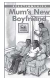
Single copy: 978-1-905579-64-8 Value Pack (6 copies): 978-1-905579-70-9