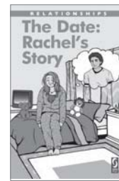
Single copy: 978-1-905579-68-6 Value Pack (6 copies): 978-1-905579-74-7