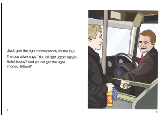
Sample spread from 'Everyday Money'