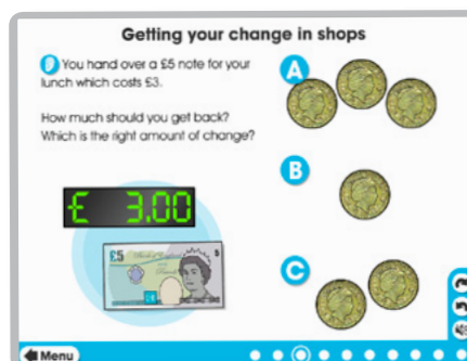
Sample screen from 'Everyday Money' computer activity